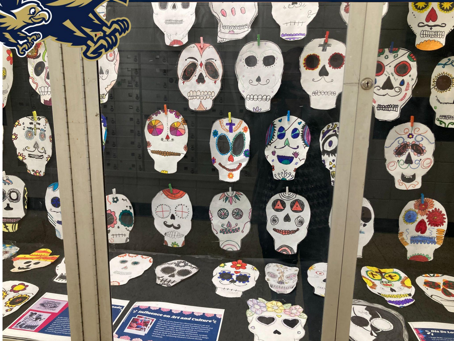
Students designed their own sugar skulls at Temple Hill Academy in Ms. Dutcher's art classes