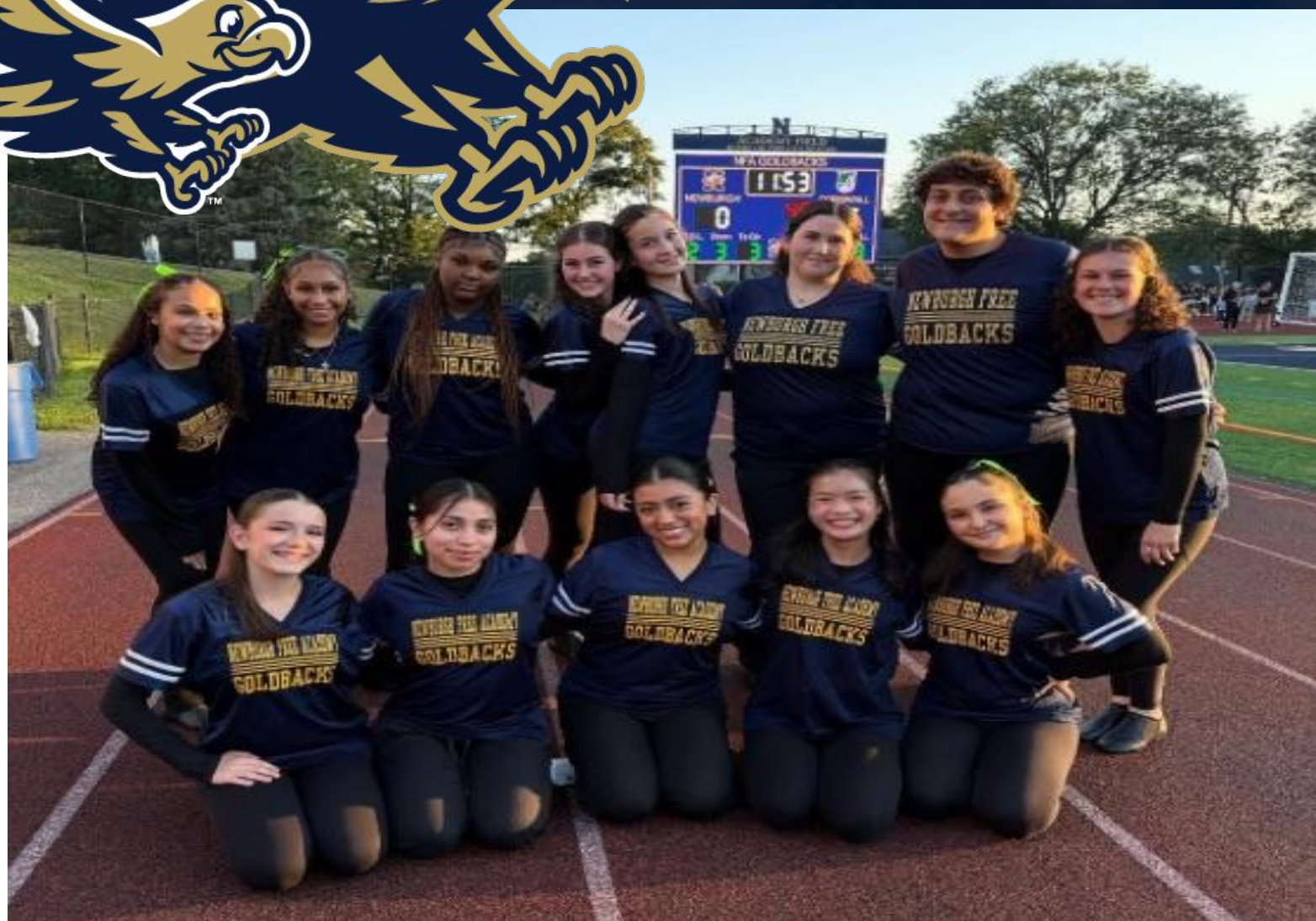
The NFA Dance Team before their halftime show at the September 12th home football game