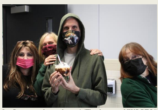
Ice Scream makes us happy! (Thank you to NWS PTO!)