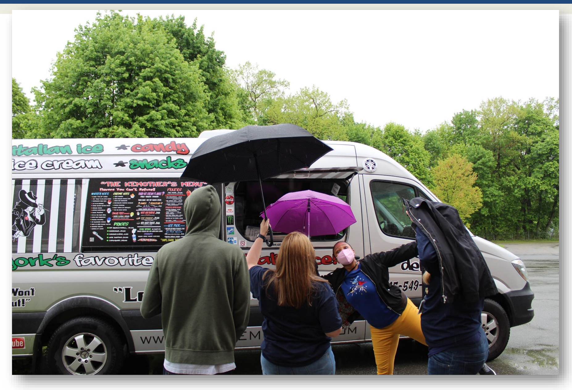
Our staff enjoying a scoop of their favorite ice cream – during a week of Appreciation! (We actually appreciate them every day...)