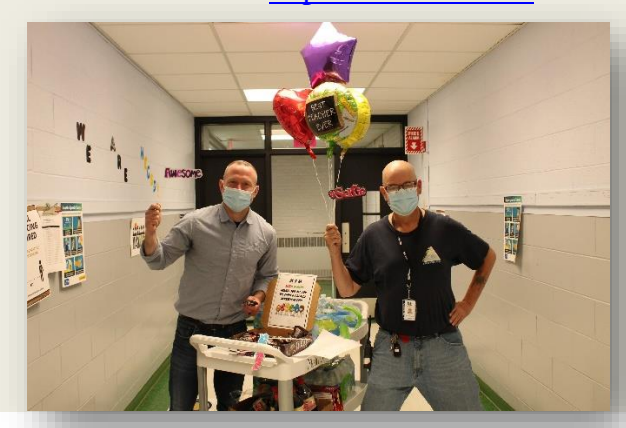
ACADEMIC PROGRESS UPDATE