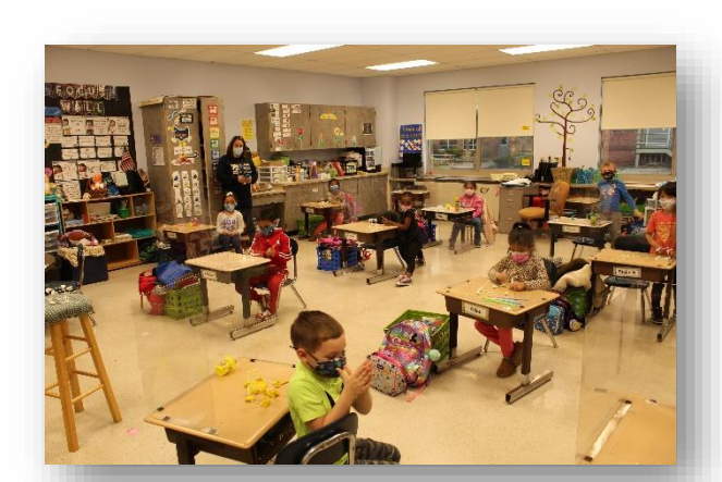
This is the new norm!

I'm sure as a parent or a guardian, you are concerned as well.