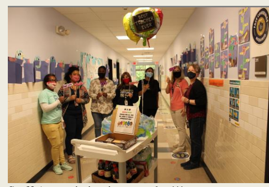
Staff Appreciation is every day!!!