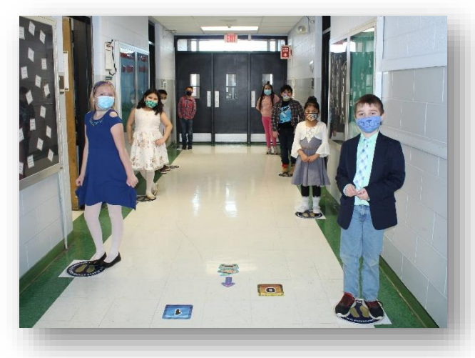
Our scholars dressed for success!