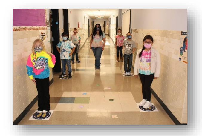
We take social distancing very seriously!